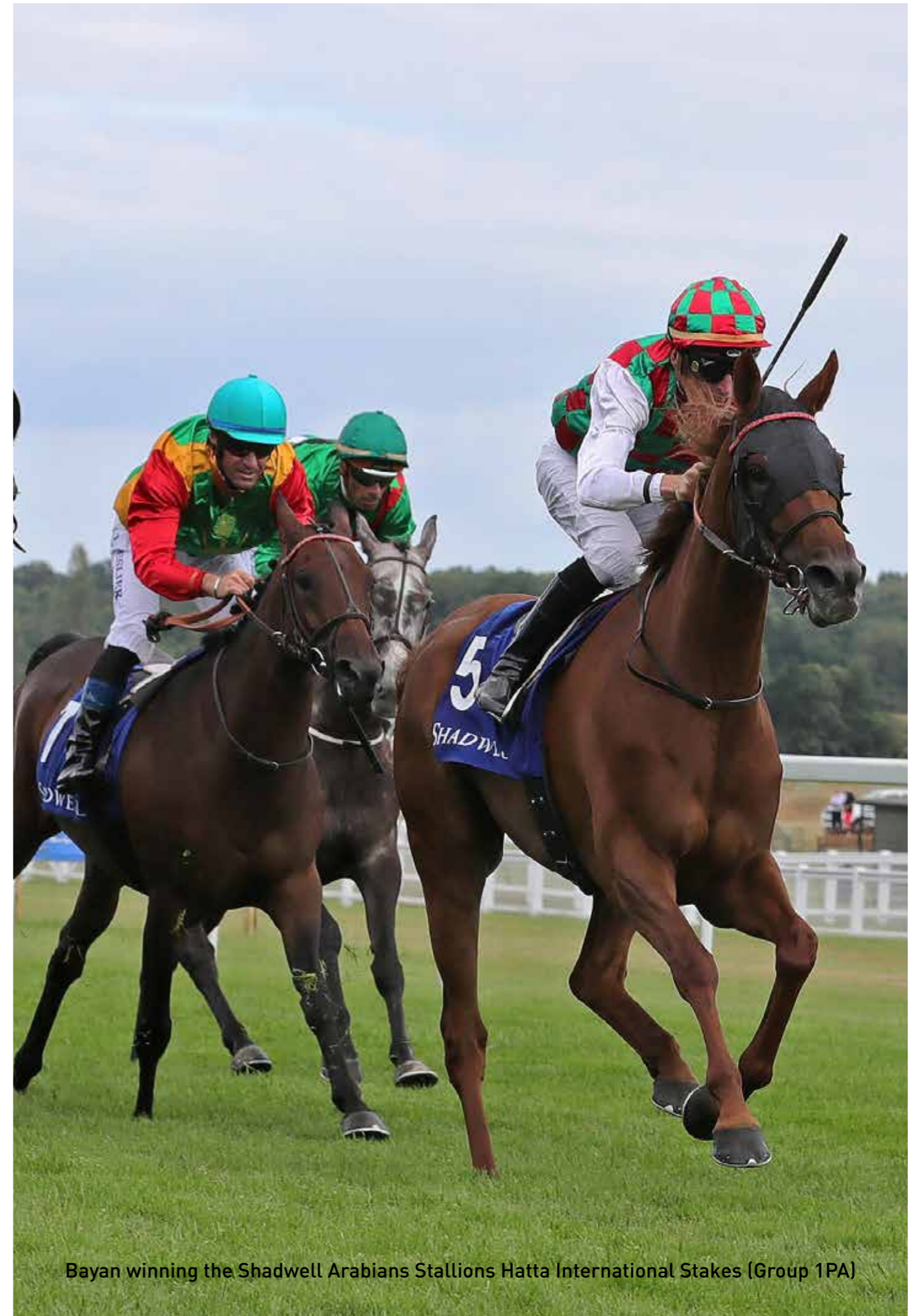
Bayan winning the Shadwell Arabians Stallions Hatta International Stakes (Group 1PA)