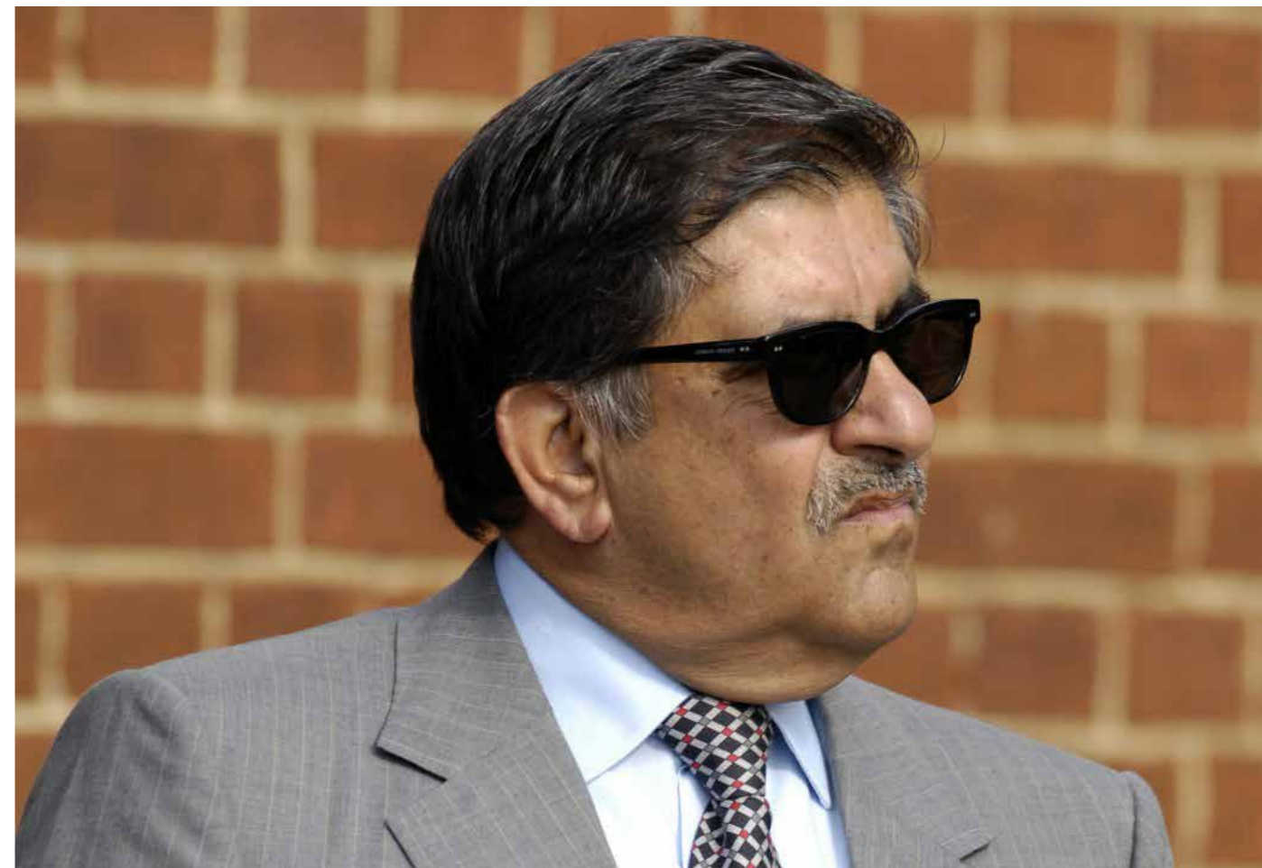
HH Sheikh Hamdan Bin Rashid Al Maktoum - patron of the Arabian Racing Organisation and champion owner for 18th time