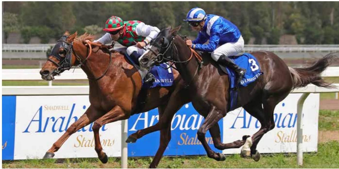
Bayan [far side] wins the Premio Taajer - UAE Embassy Stakes - DIAR prep Rome 2019