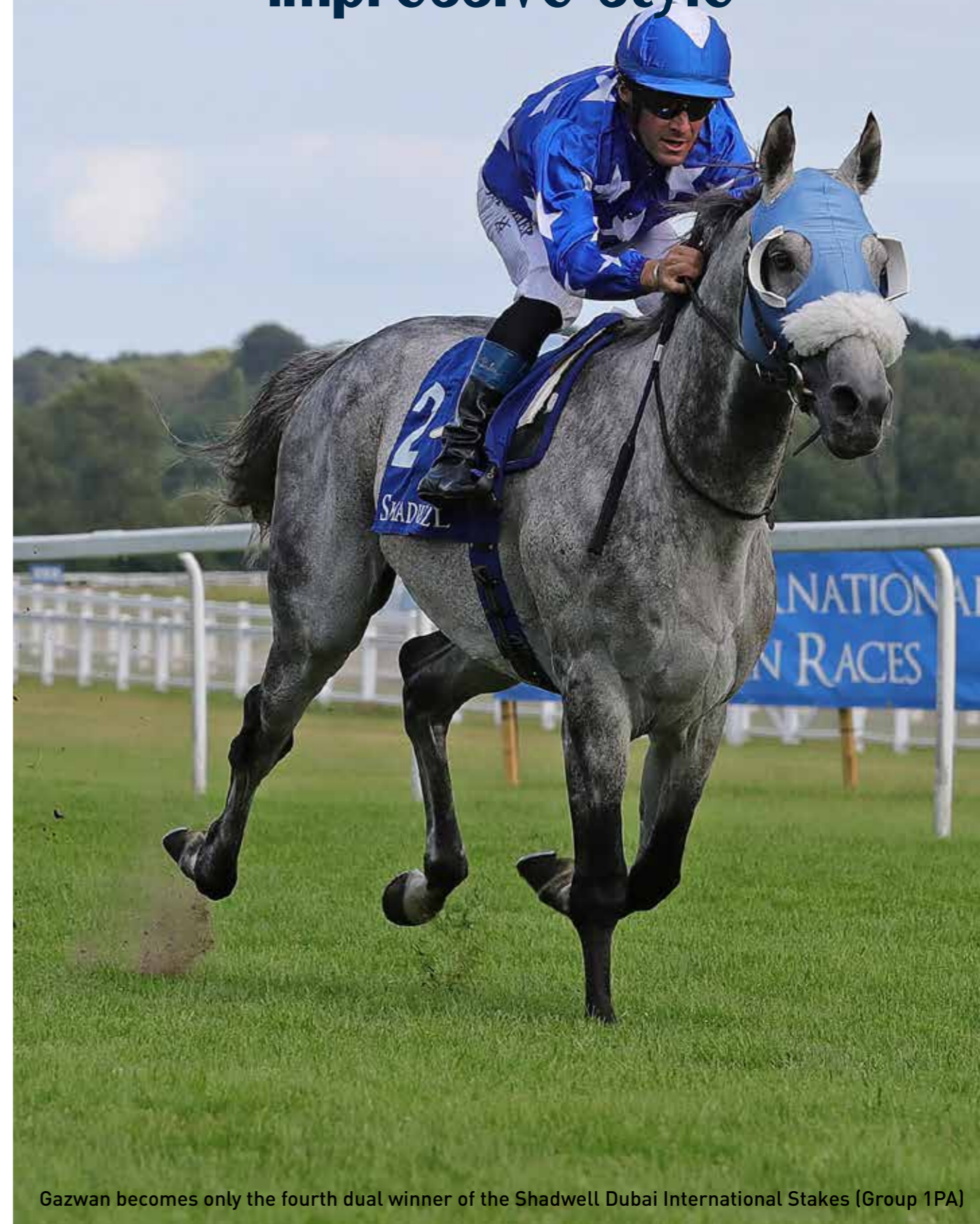
Gazwan becomes only the fourth dual winner of the Shadwell Dubai International Stakes (Group 1PA)