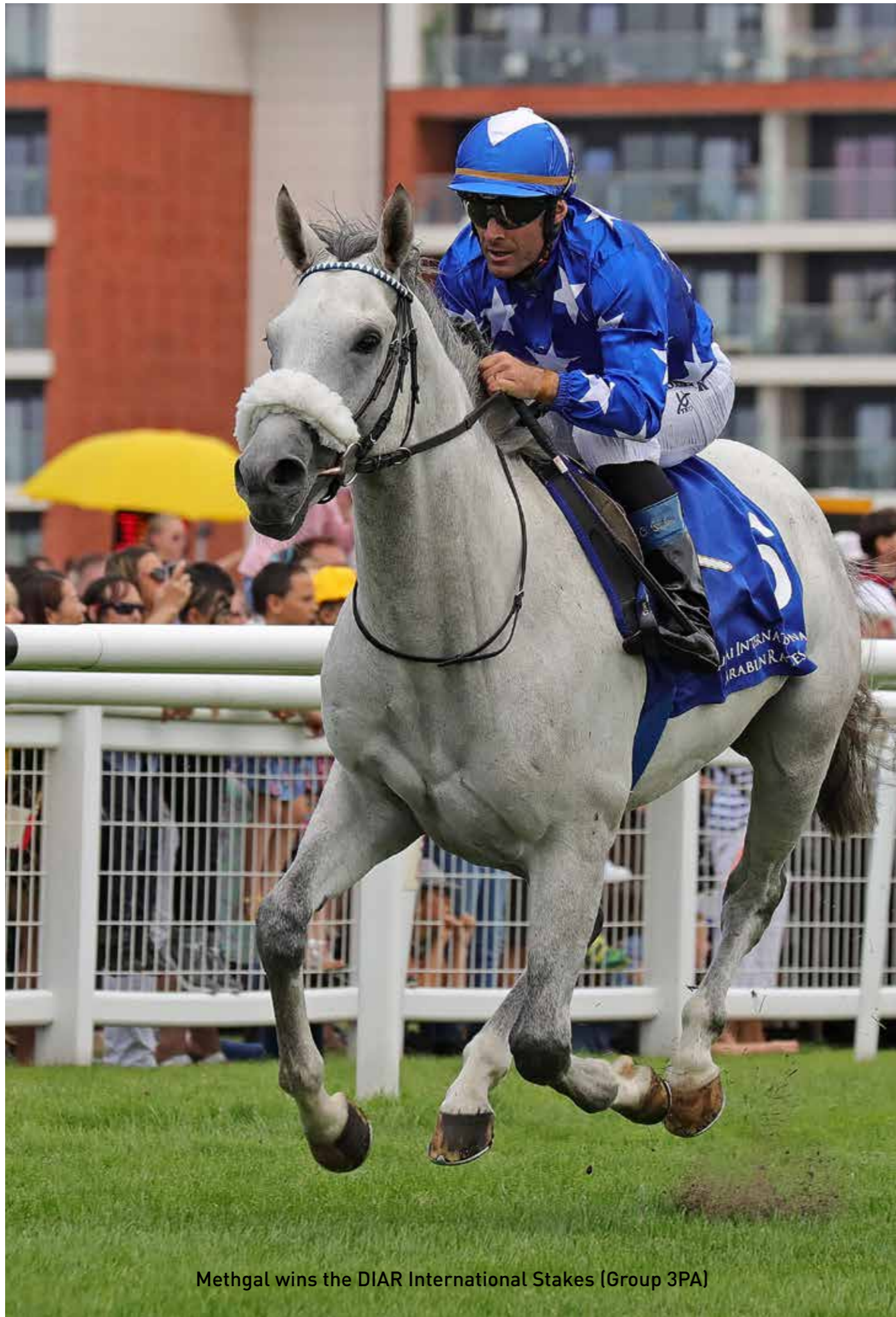
Methgal wins the DIAR International Stakes (Group 3PA)