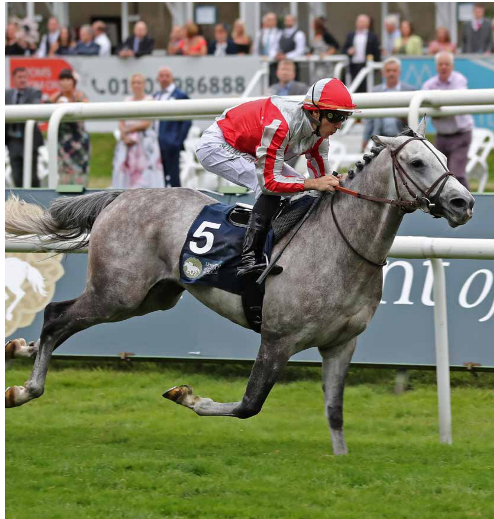
Rodess Du Loup (Christophe Soumillon) wins the 2018 President of the UAE Cup at Doncaster