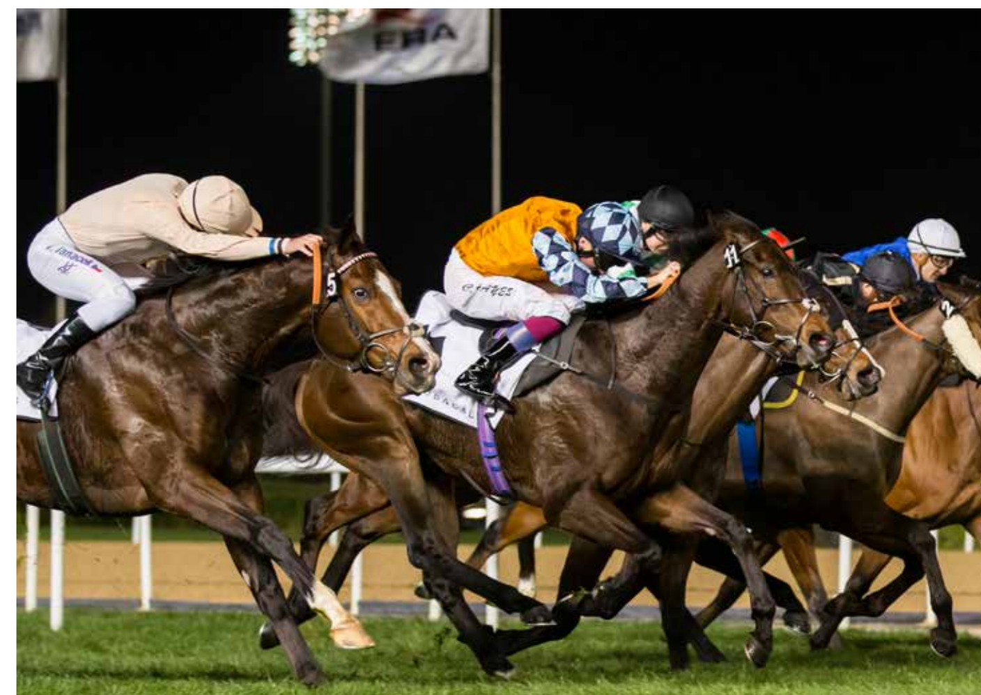
Another thrilling turf dash! Melbourne 10's DREAM TODAY defeats an international handicap field in the $175,000 Cleveland Clinic Abu Dhabi World Class Healthcare Cup in a six-horse photo finish.

Source: Media Department, Dubai Racing Club