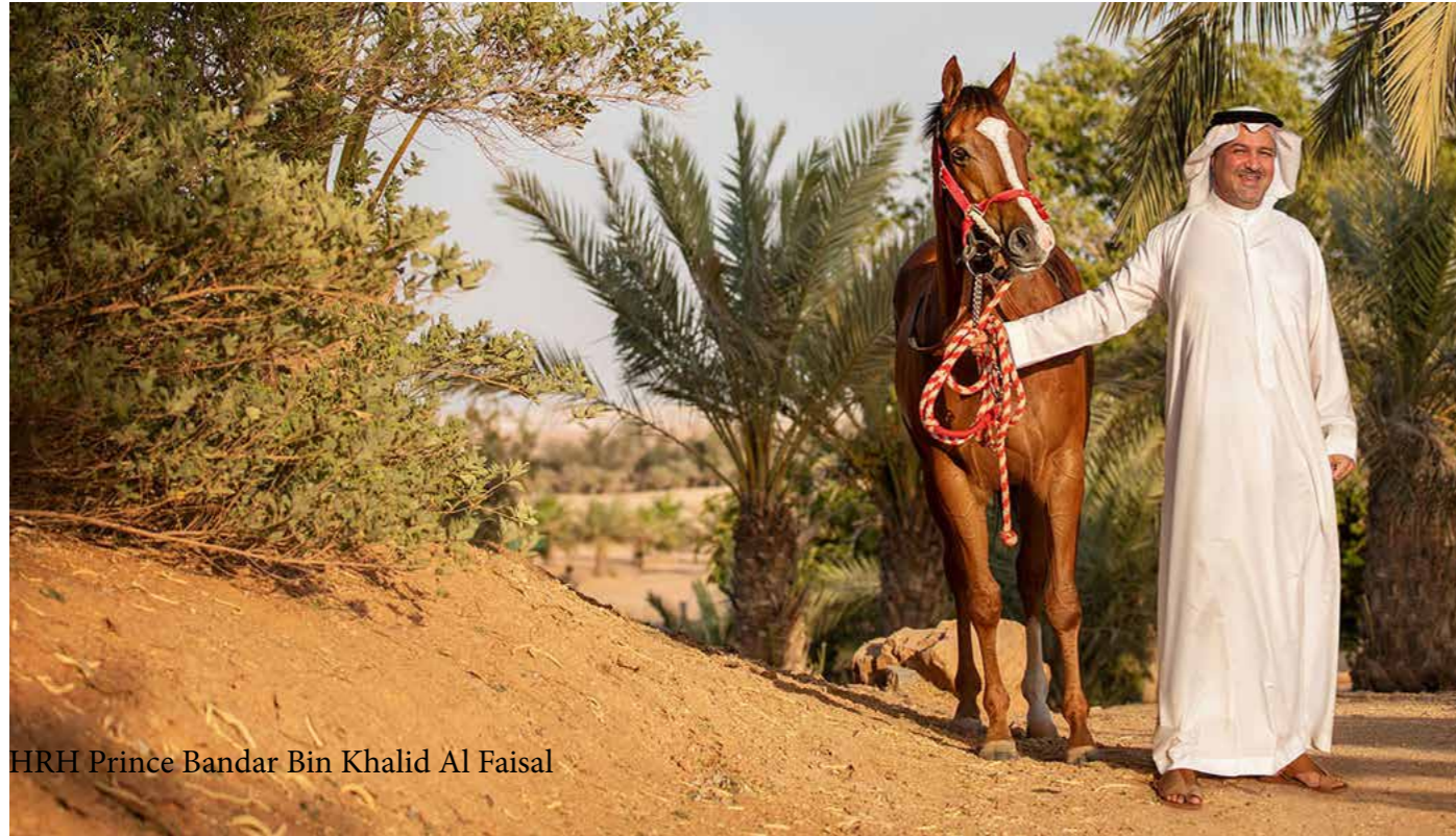
HRH Prince Bandar Bin Khalid Al Faisal

The world has a new richest race, with the announcement of the creation of the $20m Saudi Cup, to be run at King Abdulaziz Racetrack in Riyadh on February 29th, 2020. Details of the contest were announced by Prince Bandar bin Khalid Al Faisal, chairman of the Jockey Club Of Saudi Arabia, at a launch event in Saratoga today.