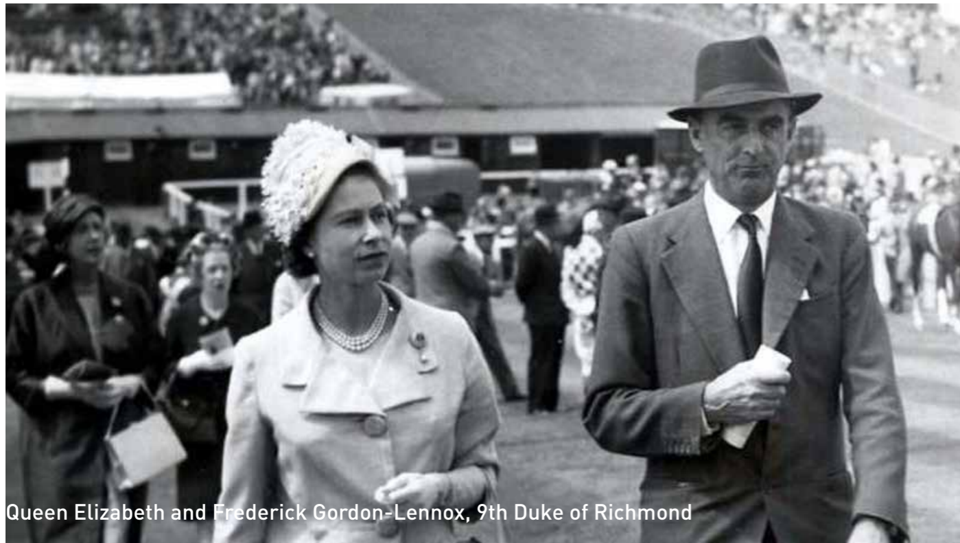
Queen Elizabeth and Frederick Gordon-Lennox, 9th Duke of Richmond

A head-to-head race was the highlight: Rebel, owned by the Prince Regent (later King George IV) beat Cedar, owned by the Duke of Richmond, for 100 guineas.