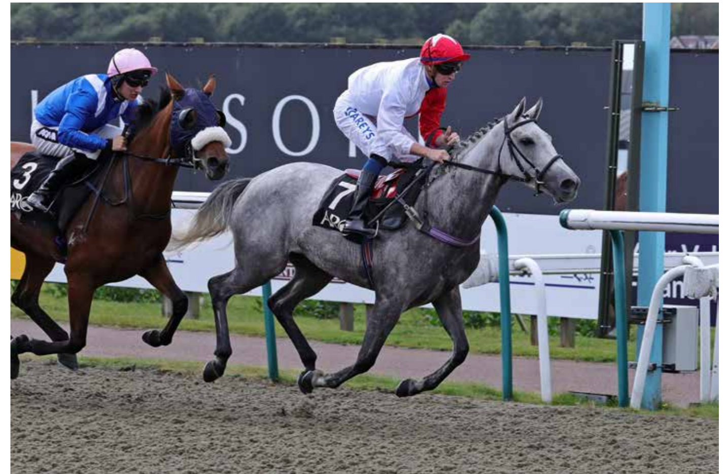
Champion Purebred Arabian Mare: Abiyah Athbah