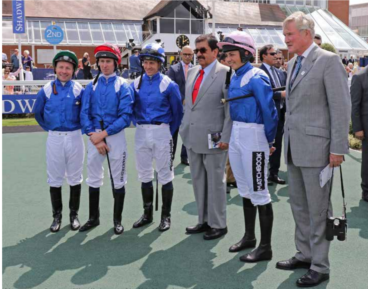
Champion Owner: His Highness Sheikh Hamdan bin Rashid Al Maktoum