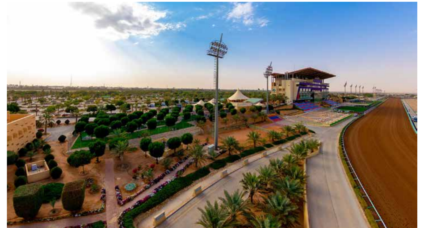
King Abdulaziz Racetrack